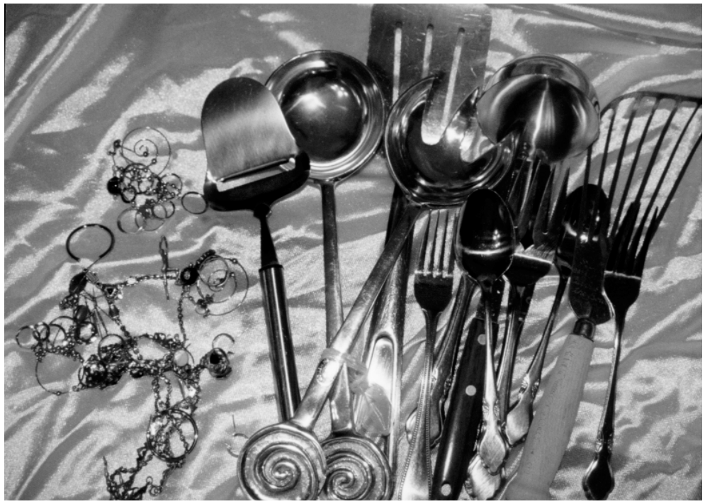
A few of the items that might one day be made from decontaminated radioactive scrap.