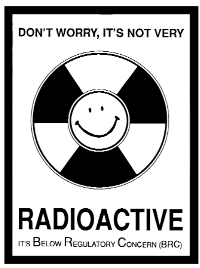
A postcard from Greenpeace Atlanta's anti-BRC campaign in 1990.

panies calibrate them down as tightly as they can to right above background levels of radiation," he said.